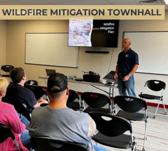
WILDFIRE MITIGATION TOWNHALL