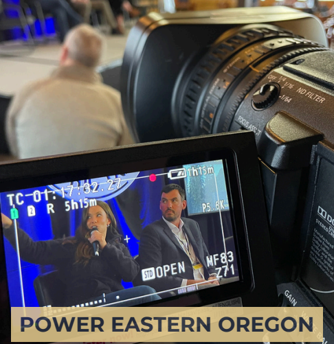
POWER EASTERN OREGON