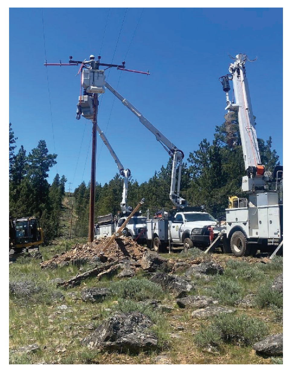
Oregon Trail Electric Cooperative crews perform maintenance and repairs in Baker County.

We have all felt the impacts of inflation at different times in our lives. Most of us have, at some point, uttered something like, "Wow, I can't believe how much this has gone up in price!" We may experience this at the grocery store or gas station, or when we sit down to pay our monthly bills.