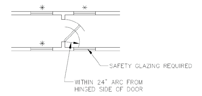
FIGURE R308.4.1 GLAZING ADJACENT TO DOOR